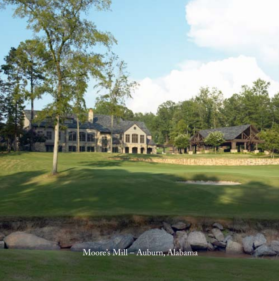
Moore's Mill – Auburn, Alabama