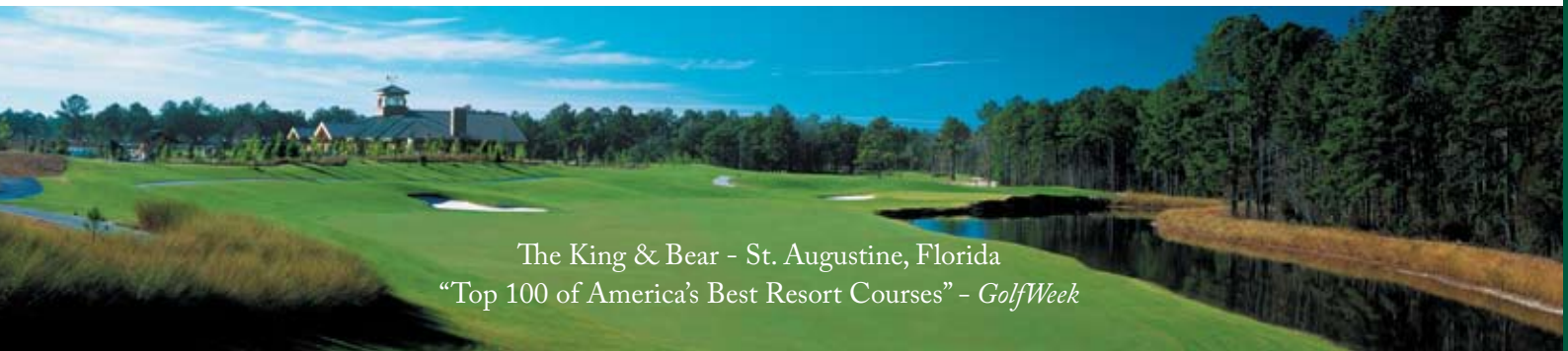
The King & Bear – St. Augustine, Florida "Top 100 of America's Best Resort Courses" – GolfWeek

Internships are located at various Honours Golf properties throughout the Southeast and may be as short as 12 weeks or as long as 7 months.