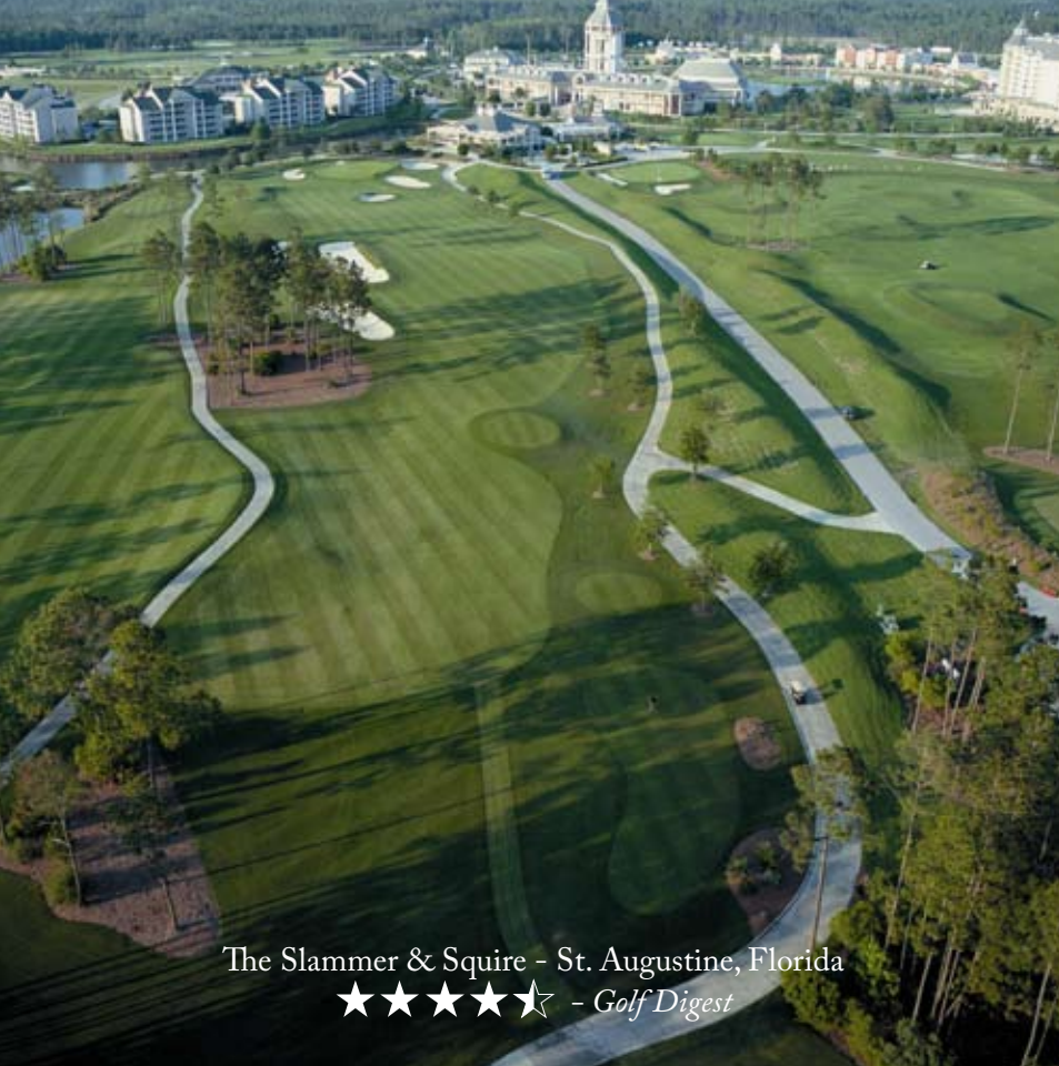
The Slammer & Squire - St. Augustine, Florida ★★★★★ - Golf Digest