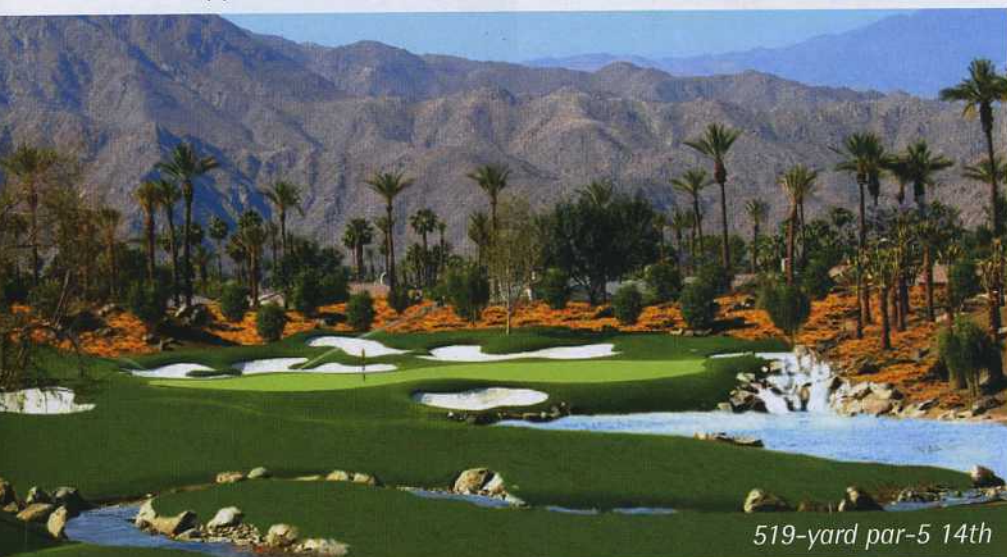
519-yard par-5 14th