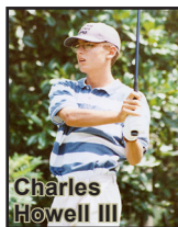
Charles Howell III