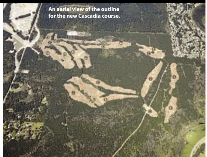
An aerial view of the outline for the new Cascadia course.