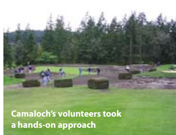
Camaloch's volunteers took a hands-on approach

Even though its present configuration has existed for getting on 17 years, Camaloch is still very much a work in progress. But as long as Gary Schopf is doing the work, its future looks bright.