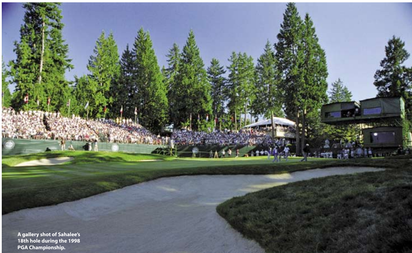
A gallery shot of Sahalee's 18th hole during the 1998 PGA Championship.

I feel we always need to be respectful and appreciative for the path that others have set for us, and I think Sahalee Country Club deserves a big "Thank You" for setting the standard and opening the door for great things to come for golf in Washington State.