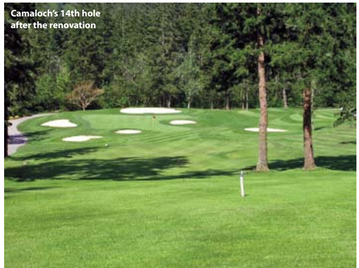
Camaloch's 14th hole after the renovation

Carpentier admits the money hasn't always been there, however. "There are always other projects around the neighborhood (the Ca-