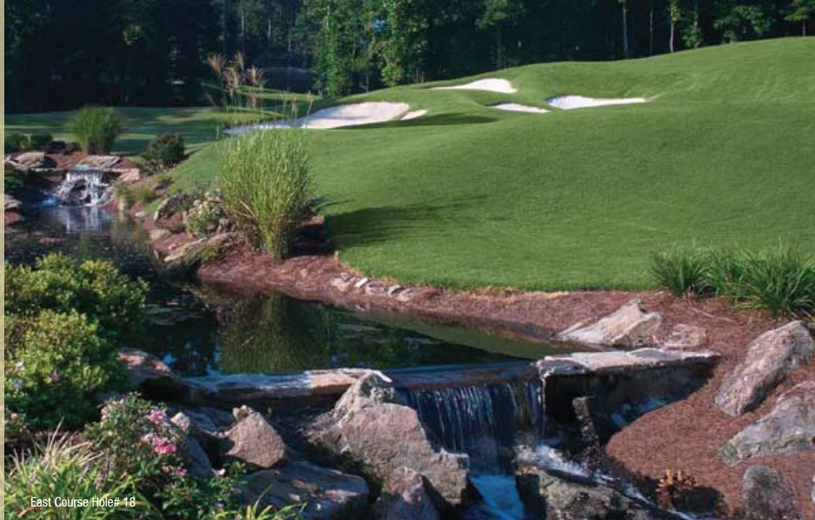
East Course Hole# 18

All meals come with coffee, tea & water station.