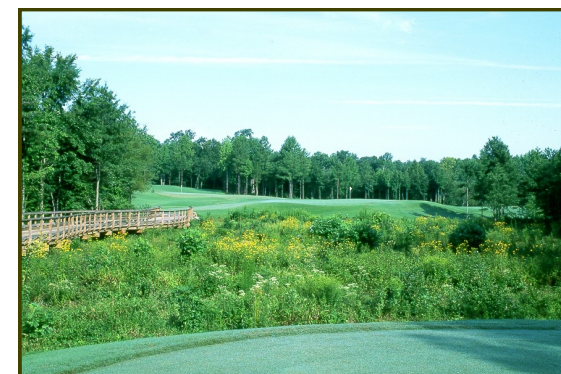
The Sawyer Center campus features a Tom Fazio design 9 hole Short Course for campers to practice on-course skill development.

Golf Club members have the opportunity to participate in youth and junior golf tournaments throughout the year. Visit www.vsga.org and check out the VSGA Junior Golf Club tournament schedule today!